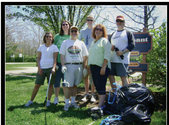
The Ghosts of Ohio road clean-up crew at Resor Road on April 24 th .

If you are interested in coming out and helping The Ghosts of Ohio with their roadside cleanup, please send an email to info@ghostsofohio.org .