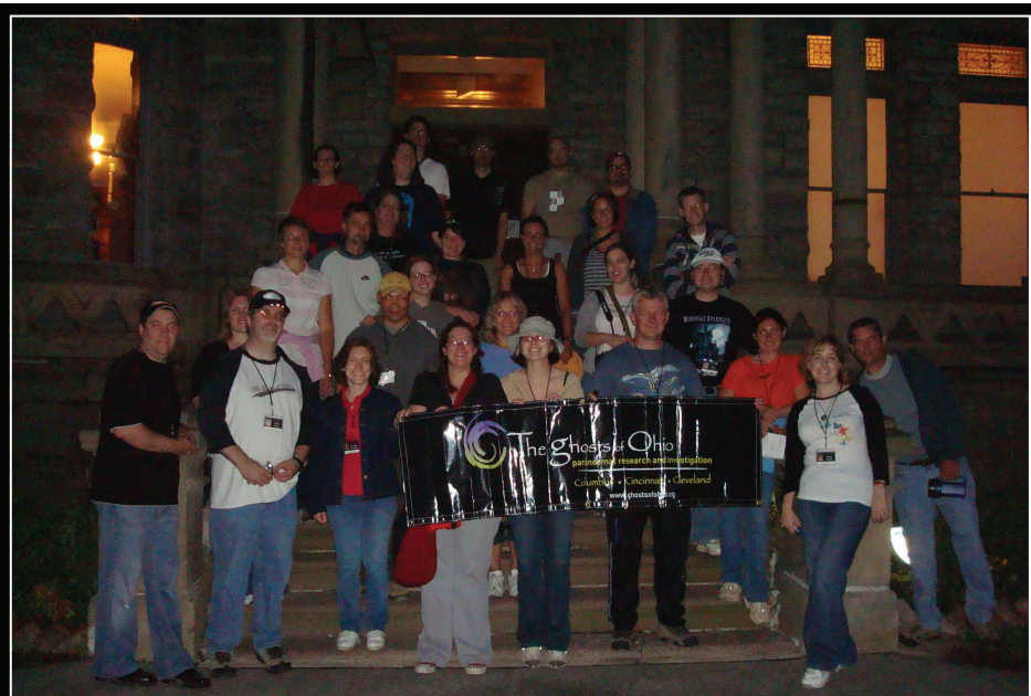
The Ghosts of Ohio at Mansfield Reformatory in Fall 2008.

If for some reason you don't have your own subscription, what are you waiting for? Sign up at http://ghostsofohio.org/services/newsletter.html .