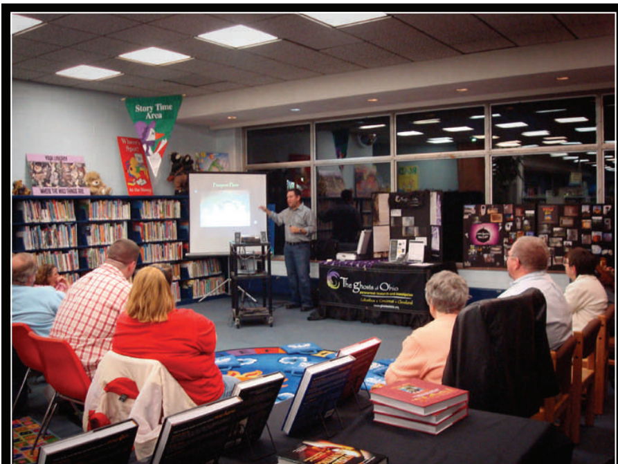
Check out The Ghosts of Ohio at an upcoming presentation near you!

Wednesday, October 28 th @ 7:00 pm Meet The Ghosts of Ohio presentation Upper Arlington Public Library 2800 Tremont Road Upper Arlington, OH 43221 http://www.ualibrary.org/