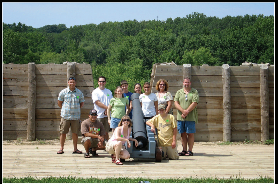
The Ghosts of Ohio at Fort Meigs—Circa 2007.

At present time, rumors run rampant about anniversary celebrations and Ghosts of Ohio merchandise giveaways. And while we cannot confirm or deny any of those rumors, we can tell you that there will be a lot of anniversary-related surprises popping up in the coming