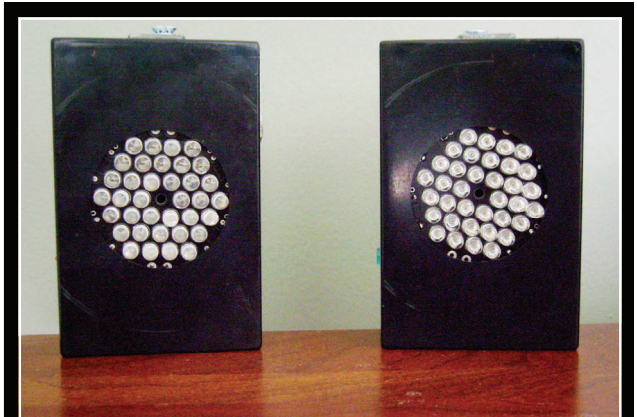
IR Extenders increase the range of infrared cameras, allowing enhanced views of large rooms and long corridors.