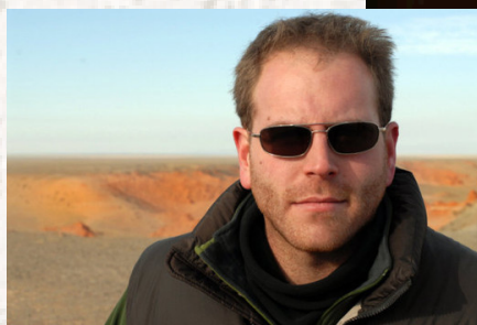
Josh Gates Executive Producer of Stranded