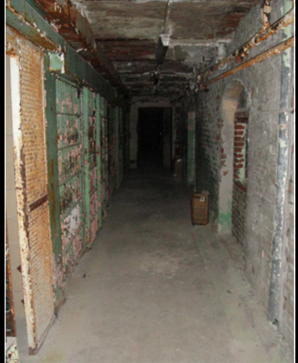
Images of solitary confinement at Mansfield Reformatory. Is there a paranormal presence in these dark corridors?