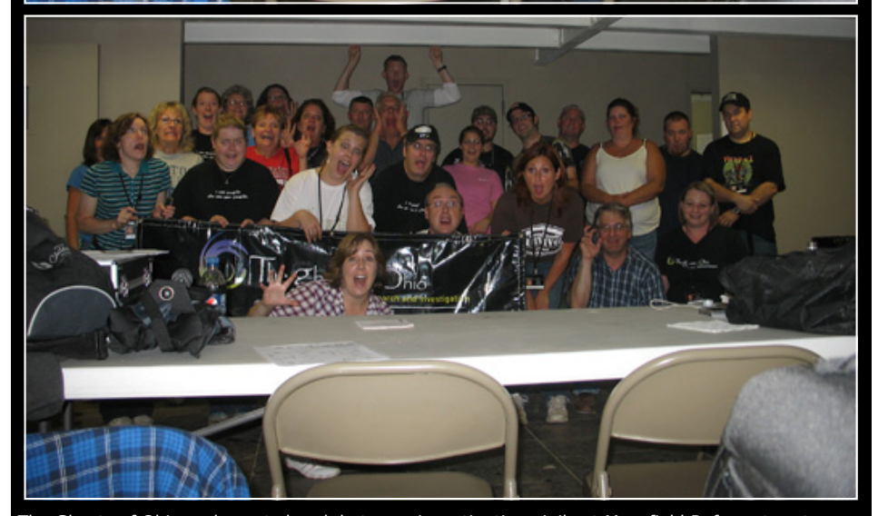
The Ghosts of Ohio and guests break between investigation vigils at Mansfield Reformatory to show their spooky side on August 6^{th} .