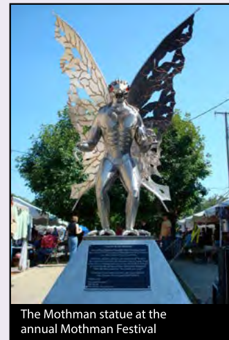
The Mothman statue at the annual Mothman Festival

December 15th, 1967. It was rush hour during the heart of the Christmas shopping season, when one eyebar on the heavily trafficked suspension bridge spanning the Ohio River gave way, setting off a chain reaction that caused all 1,460 feet of the structure to plummet into the frigid waters below, killing 46 people. It was deemed one of the worst road bridge disasters in U.S. history, and it could have been prevented had the powers-that-be spent the extra money to have it built according to its original design—with cables instead of eyebars. Unfortunately, in 1927, eyebars were the hot new idea, and designers didn't know about the amount of heavy traffic the bridge would have to endure just 40 years