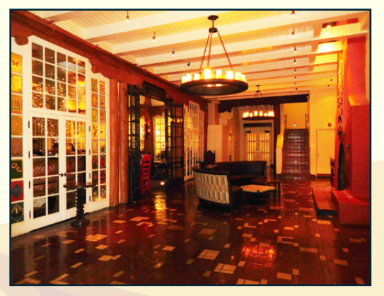
The La Fonda

We started out meeting at the only Santa Fe hotel that is located on the Plaza, La Fonda. The first inn on that site was built when Santa Fe was settled in 1607, so you know with over 400 years of humans living, loving, fighting and dying on this spot, there's bound to be a ghost, right? The current building that you see was built in 1922, and is filled with all the splendor of that age. What used to be a courtyard is now the main dining room, and it is here that you can possibly encounter the ghost of a man who lost his company's money