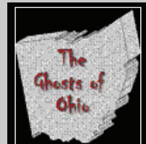
The GOO Logo, circa 2001.

At present time, rumors run rampant about anniversary celebrations and Ghosts of Ohio merchandise giveaways. And while we cannot confirm or deny any of those rumors, we can tell you that there will be a lot of anniversary-related surprises popping up in the coming months!