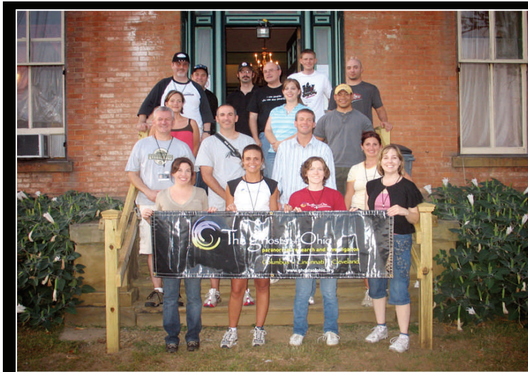
The Ghosts of Ohio at Prospect Place in Fall 2008.

If for some reason you don't have your own subscription, what are you waiting for? Sign up at http://ghostsofohio.org/services/newsletter.html .