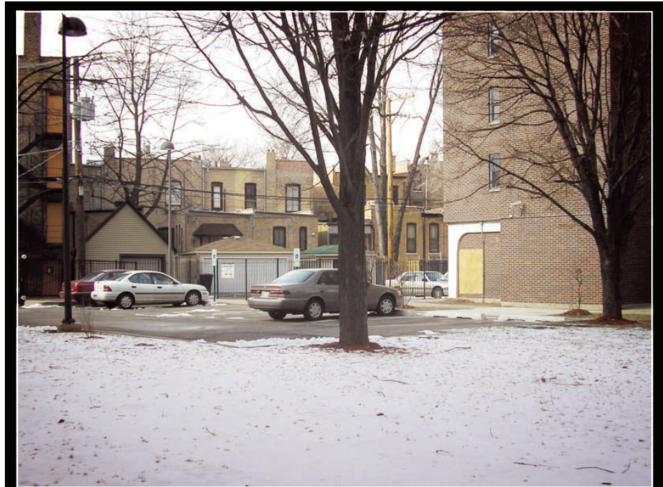
The site of the former SMC Cartage Company-Chicago, IL.