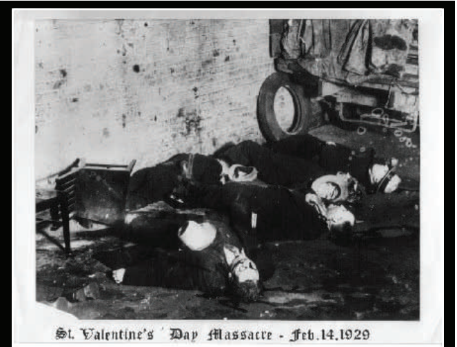
The grisly crime scene of the St. Valentines Day Massacre.

So what was the cause of what became known as the St. Valentine's Massacre? It would appear as though it was the result of bad blood between Bugs Moran's North Side gang and Al Capone's South Side gang. The two gangs had been battling for control over