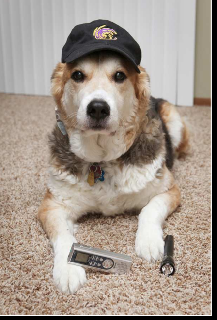
Investigator Fluffy captures some ghostly voices on his trusty voice recorder...or maybe they're ghostly barks.

their home and wreaking havoc, and no investigator wants to be responsible for damages. Does the client have pets in the home, like dogs, cats or birds? This could be a potential problem since animals don't typically like to share their spaces with other unfamiliar animals, and predator/prey instincts can run high. It's supposed to be a paranormal investigation, not a National Geographic program!