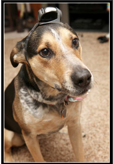
Investigator Fido travels into dark corners of haunted locations with his trusty headlamp, and stash of dog biscuits.

Here's my plea to everyone reading this article: If you're presented with the opportunity to have a dog included on an investigation, be smart about it. Consider it carefully, do your homework, and create some legal documents so that, if something bad happens, the responsibility falls on the correct shoulders.