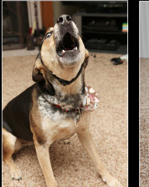
Investigator Fido tries to provoke the spirits (and human investigators, clients, neighbors, etc.) in a recent EVP session.

First of all, it must be understood that a dog is an animal. It is not a human being. Bringing an animal into an unfamiliar environment and expecting it to perform tasks requires a very high level of obedience and discipline. No one wants a strange dog coming into