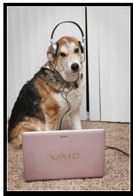
Investigator Fluffy reviews evidence from a recent case, and consequently drools on all of the equipment.