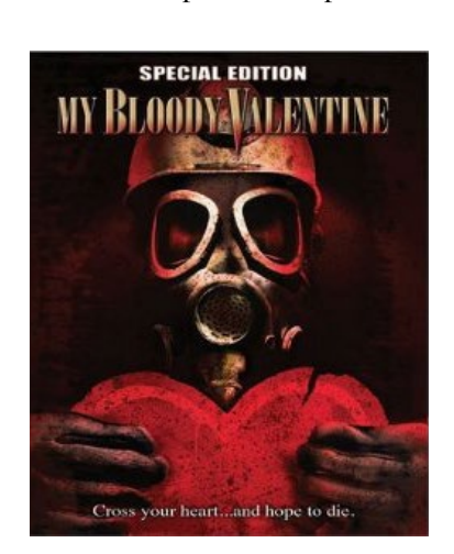
Cover of Special Edition DVD

was able to survive by chowing down on the remains of the other miners. So naturally, Warden gets pulled from the mine and deposited in the local mental asylum, where he sits patiently until the next Valentine's Day. That's when he breaks out, hunts down the men responsible for leaving their posts prior to the fateful explosion, dispatches