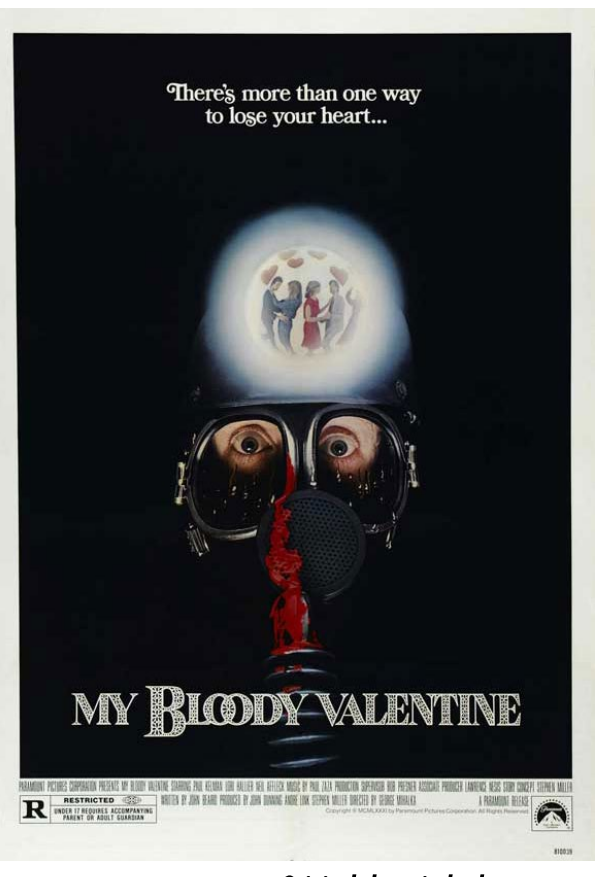
Original theatrical release poster

them, and then promptly vanishes. But not before issuing a dire warning to the entire town: Don't hold anymore Valentine's dances or else he would return.