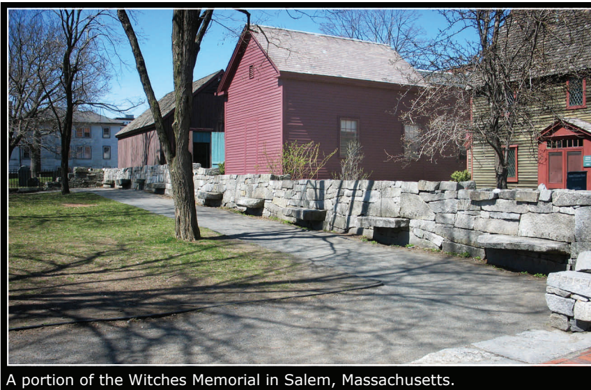
A portion of the Witches Memorial in Salem, Massachusetts.