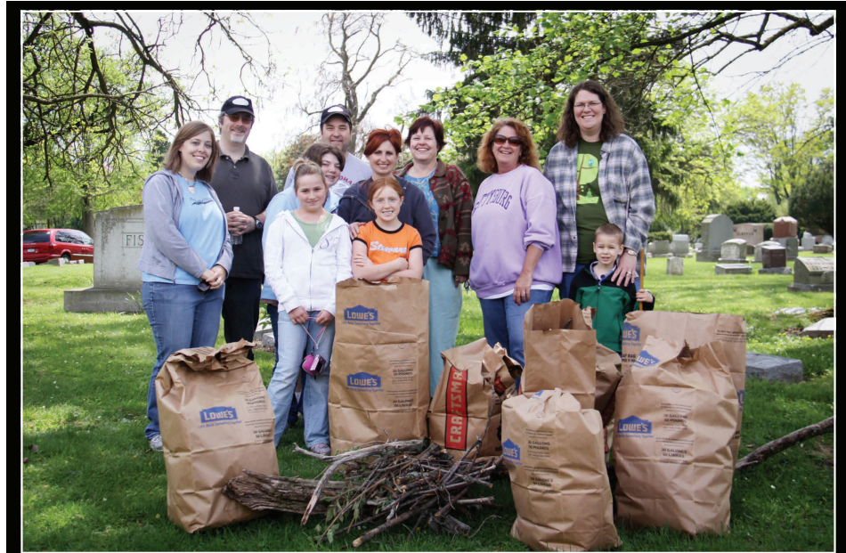
The Ghosts of Ohio cemetery clean-up crew at Greenlawn on May 2 nd .

The volunteers had a great time donating their time to an important community service project. We encourage you to grab some yard gloves and join us for one of our upcoming cemetery clean-ups. We would love to see you there! For more information, please contact info@ghostsofohio.org .