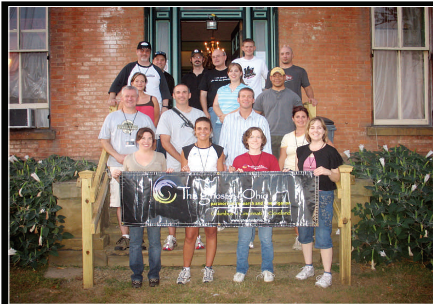
The Ghosts of Ohio at Prospect Place in Fall 2008.

If for some reason you don't have your own subscription, what are you waiting for? http://ghostsofohio.org/services/newsletter.html .