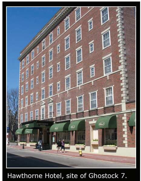
Hawthorne Hotel, site of Ghostock 7.