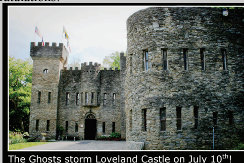
The Ghosts storm Loveland Castle on July 10 th !

See you all on July 10 th . As with our past Spend the Night excursions, we'll be sure to post pictures of the investigation on our website so you can be the envy of all your friends!