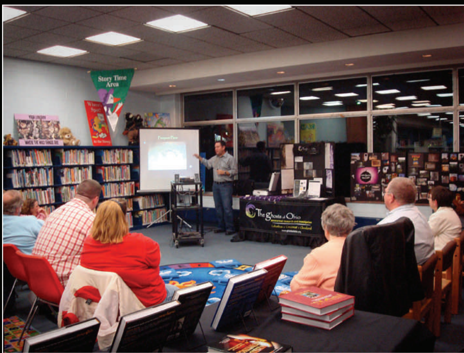
Check out The Ghosts of Ohio at an upcoming presentation near you!

Wednesday, October 28 th @ 7:00 pm Meet The Ghosts of Ohio Presentation Upper Arlington Public Library 2800 Tremont Road — Upper Arlington, OH 43221 http://www.ualibrary.org/