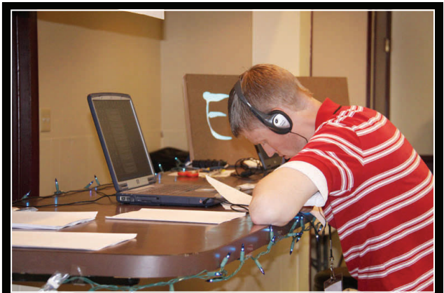
The EVP Bar was a popular attraction at this year's event and put the listener's interpretation skills to the test.

Also available for attendees were several booths that offered a variety of services, including: psychic readings, ghost tour information, dowsing rods and pendulums for sale, hand massages,