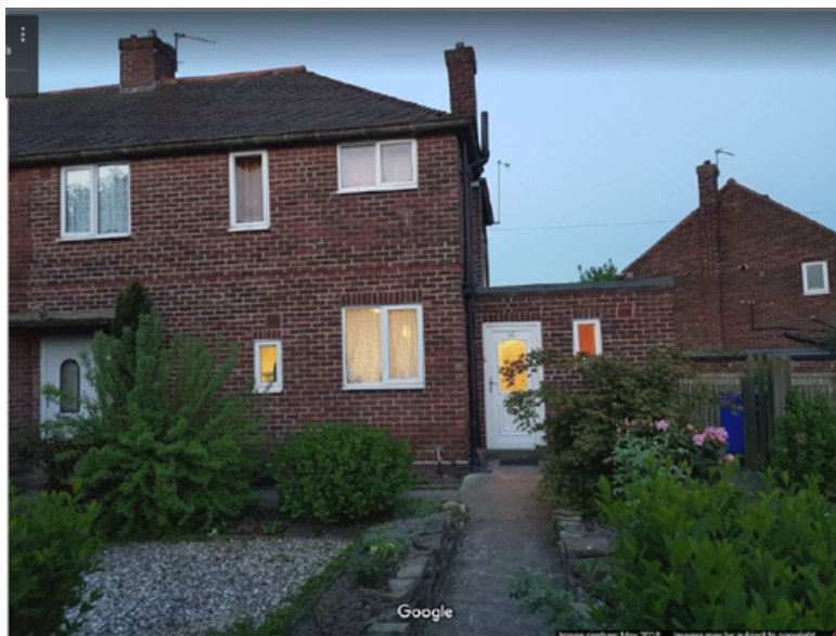
30 East Drive

I am also wondering what is really going on in 30 East Drive. Is it just an angry spirit or something more demonic? I am not an angel/demon type of person; my feelings and beliefs are much more pagan. Looking at some of the evidence, especially ankles that are gripped, burned and scratched, it smacks to me of an earth elemental. Since this council house was built on a bloody battlefield, over