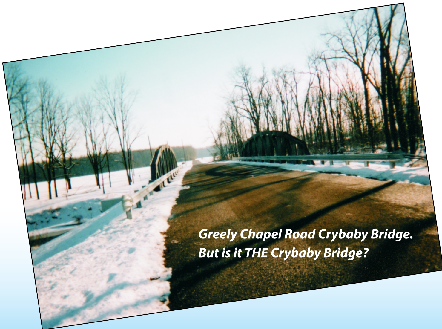
Greely Chapel Road Crybaby Bridge. But is it THE Crybaby Bridge?

So tell us, Lima: Where's your Crybaby Bridge at? If it's somewhere other than Greely Chapel Road, we want to hear from you! We realize we're being a bit vague here, but it's on purpose. We don't want to sway you by providing too much information. What we can say is that the story surrounding this bridge is said to have been around since the 1980s and does not involve any of the specifics usually associated with the bridge on Greely Chapel Road (including the school bus accident).