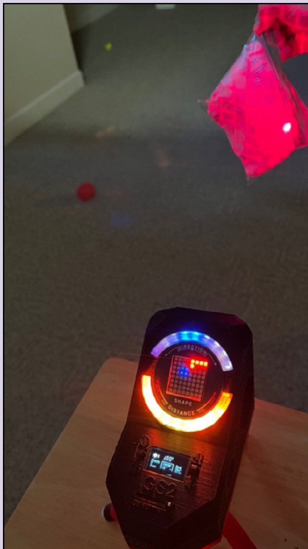
When placed in close proximity to the G2, the device was able to detect both the bag of ice (blue squares) as well as the person holding the bag (red squares)