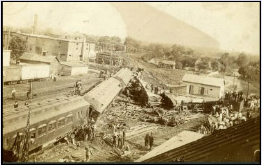
1904 Big Four Depot train wreck

It was a fun excursion, but it was ghost- and satanist-free. And while the stories certainly feel like urban legends, we were able to confirm that there was indeed a fatal train wreck in the area back around noon on Saturday, June 25, 1904. A Cleveland-to-Columbus express train was running almost 2 hours behind when it came speeding through Delaware. Unable to navigate a sharp turn, the engine and a baggage car left the tracks and crashed in a ditch. Three people were killed with 10 others sustaining injuries. However, it should be noted that this particular accident did not take place at the railroad tracks in Blue Limestone. Rather, it was in the opposite direction and closer to downtown—near the Big Four Depot.